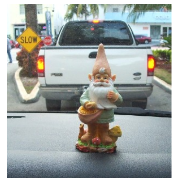
What a City!