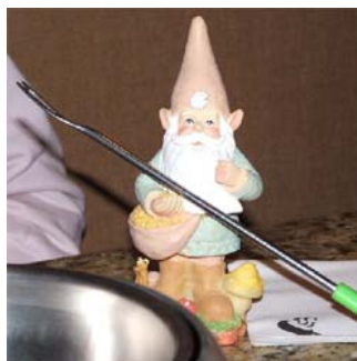
Gnome Chomsky enjoying the ‘due