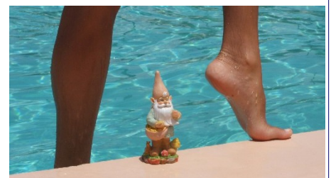
Getting an eyeful by the pool