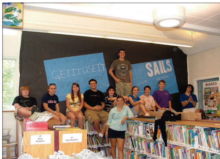
Norton teens' bulletin board for September/Library Card Sign-up Month.

Currently all sessions are filled, but be on the lookout for new sessions. MLS will send out an email if more open up. Each session lasts two weeks. Enrollment periods start the second & fourth Wednesday of each month. To get more information go to the MLS EventKeeper calendar .